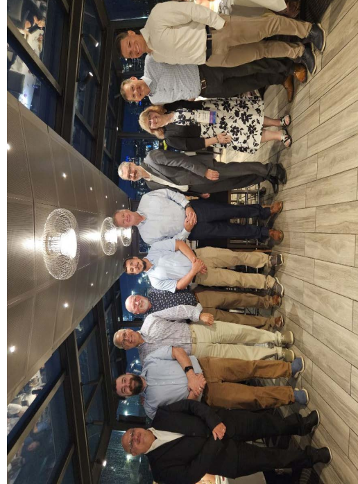
Past National Award Recipients