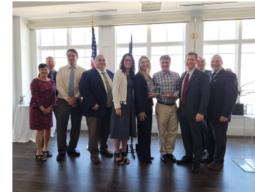
Past National Award Recipients