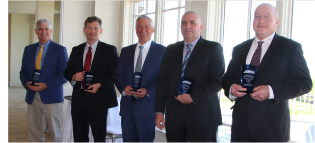
Past National Award Recipients